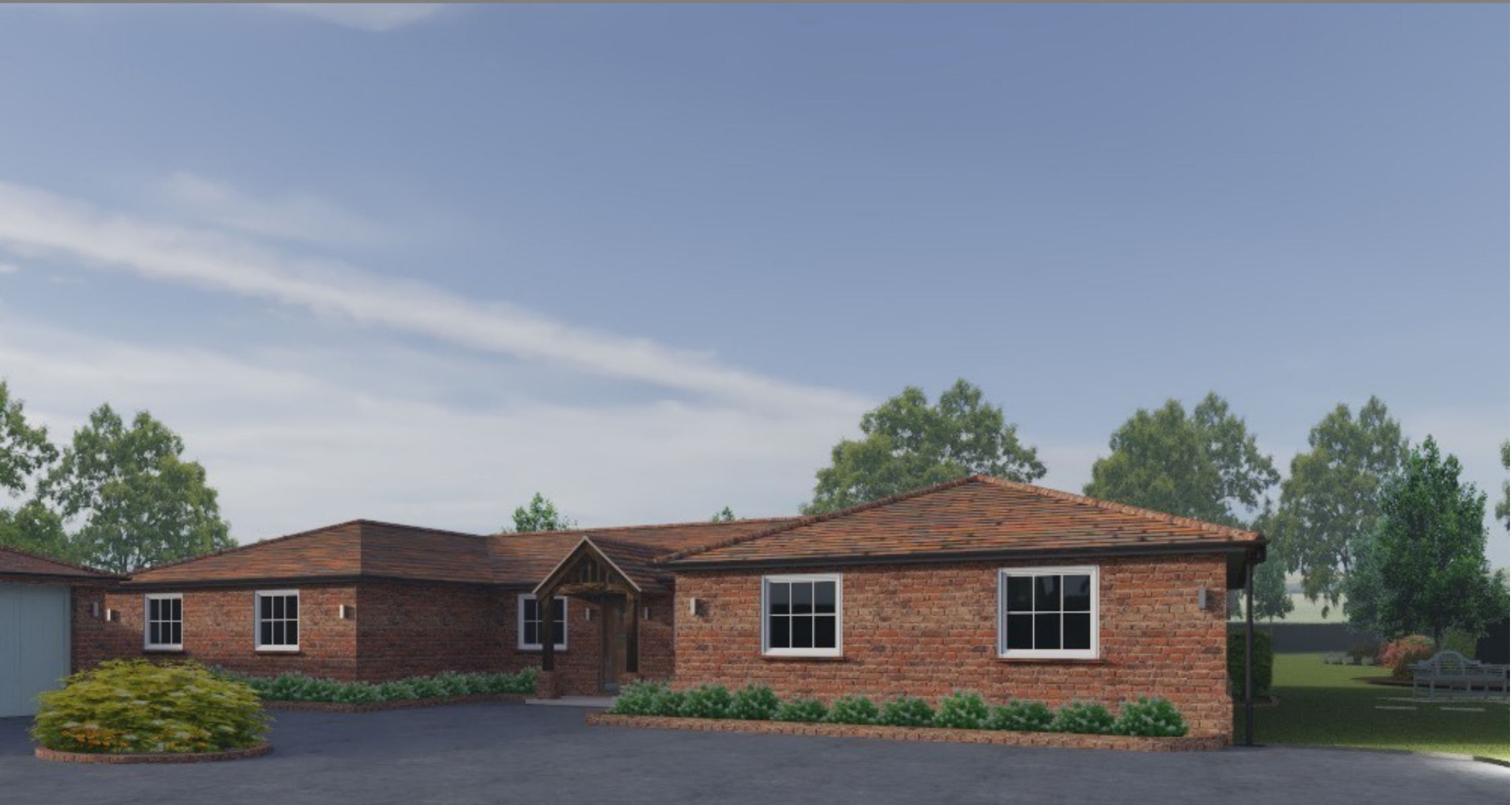
Brimfast Lane, Sidlesham Common