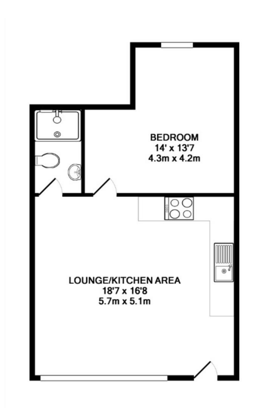
TOTAL APPROX. FLOOR AREA 511 SQ.FT. (47.5 SQ.M.)

*INVESTMENT OPPERTUNITY* *CASH BUYERS ONLY* HOP are pleased to present this modern property to market, Ideally located close to the city center in the popular Twenty Twenty development. The property is currently achieving £675 PCM returning an attractive gross rental yield of 7.5% meaning it is a great property for a first-time investor or someone looking to add to their portfolio. The apartment is well located on the ground floor, with its own entrance door and benefits from being one of the largest flats in the complex. The apartment benefits from lots of natural light and neutral décor and briefly comprises of a large double bedroom, shower room and spacious open plan kitchen/living room. EPC E.