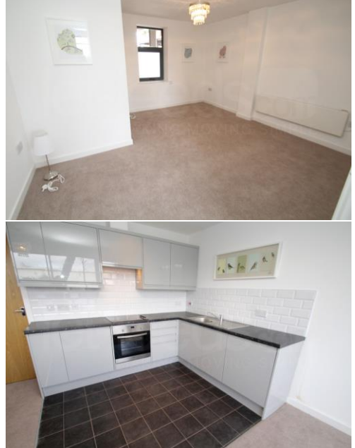
Twenty Twenty House Skinner Lane, Leeds, LS7 1BB