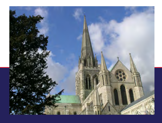
nearby Chichester Cathedral

Historic Chichester is home to some of the country's finest sights, landscapes and leisure pursuits. The internationally known Festival Theatre, Priory Park with its' historic cricket ground and Pallant House Gallery are just a few examples of the nearby facilities. There are excellent schools in the area. In the private sector are Prebendal, Oakwood, Great Ballard, Lavant House, Westbourne House School, Portsmouth Grammar and Bedales. Secondary schools in the public sector in Chichester are Bishop Luffa Church of England and the Girls and Boys High Schools. Chichester is unique in having both a College of Further Education and a University. There are also good yachting facilities at Chichester Marina, Birdham Pool and at Itchenor, home to the Chichester Harbour Conservancy and the Itchenor Sailing Club. The Salterns Way footpath and cycle route is a 12 mile path running from Chichester via Fishbourne to Birdham, Itchenor and on to the lovely sandy Blue Flag beach at West Wittering. At Chichester it connects with the Centurion Way to provide access to the South Downs National Park.