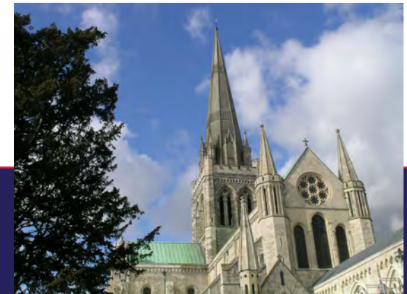
nearby Chichester Cathedral