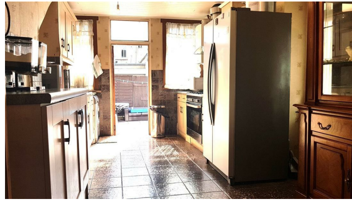
Gas oven and hob, fridge/freezer, and washing machine, Tiled flooring.