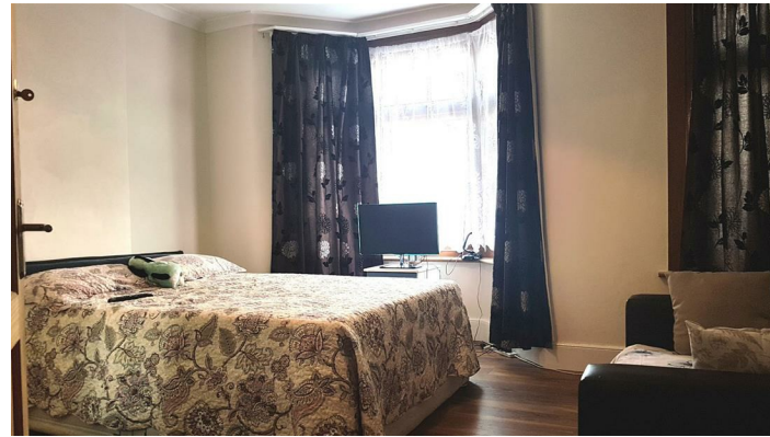
Double Bedroom. Wooden flooring. Wardrobe. Sofa. Double bed. curtains and nets.