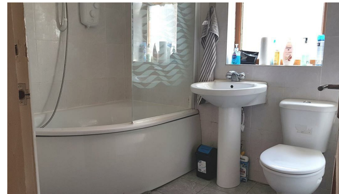
Tiled flooring. Three piece suite with electric shower.