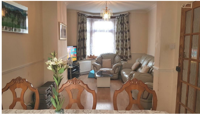
Laminate flooring. Curtains nets. Dining table and chairs. Coffee table.