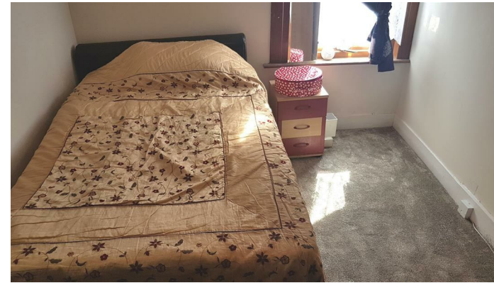
Double bedroom. Carpet. Double bed. Wardrobe. Curtains and nets.