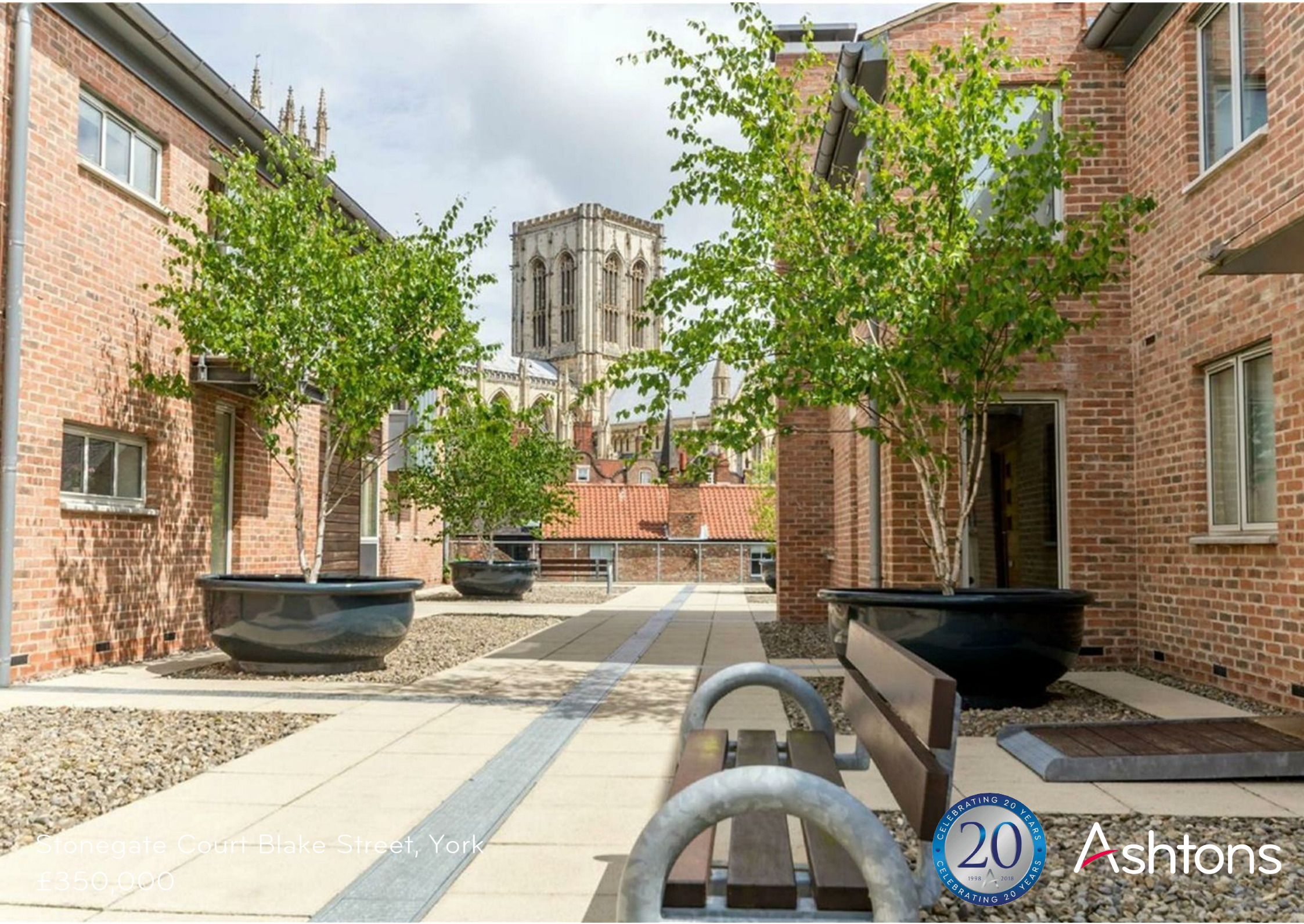
Stonegate Court Blake Street, York £350,000