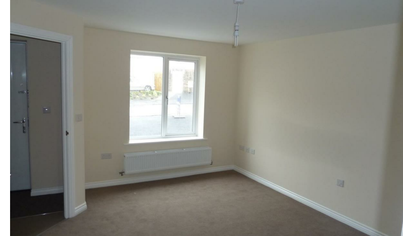
SCHOLAR ROAD, TRURO £925 PCM