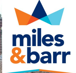
1C CHAPEL LANE CANTERBURY OFFERS OVER £250,000