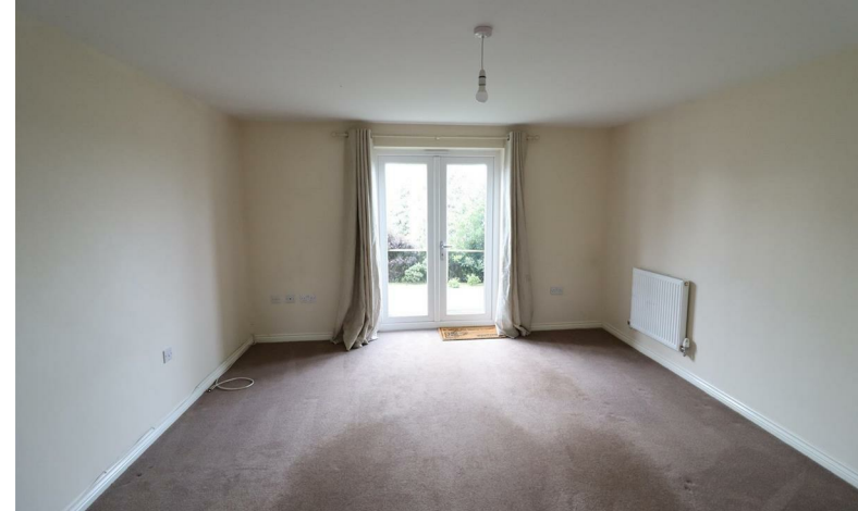
FAIRFIELDS, PROBUS £875 PCM