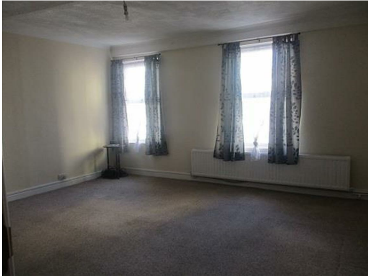
Emulsion walls, textured ceiling, fitted carpet.