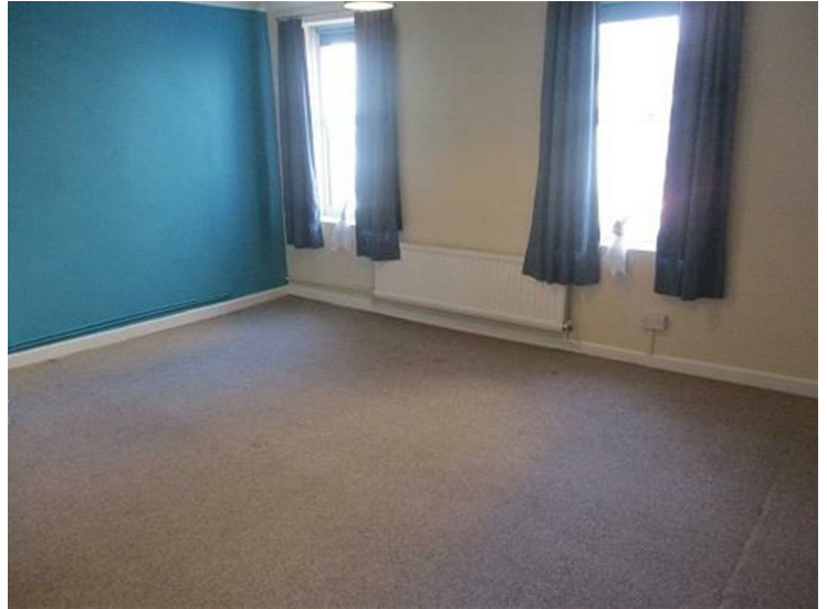
Emulsion walls, textured ceiling, fitted carpet.