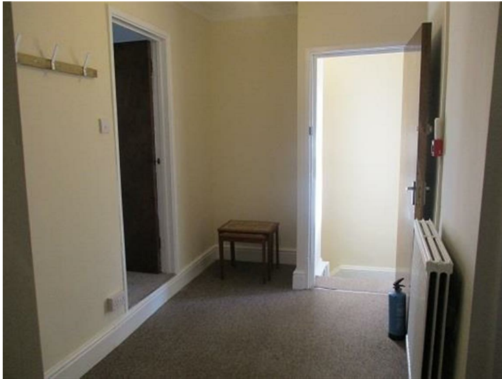
Stairs leading to hallway, emulsion walls, textured ceiling, newly fitted carpet.