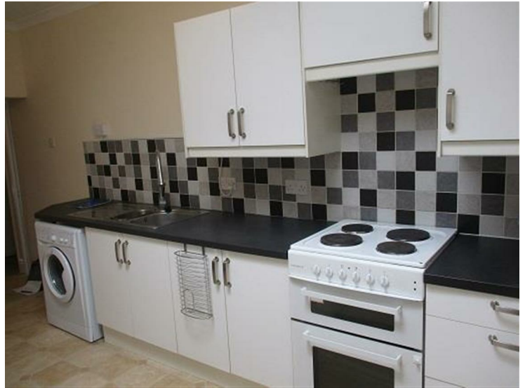
Emulsion walls, textured ceiling, fitted units, tile splashbacks, skylight, vinyl floor.