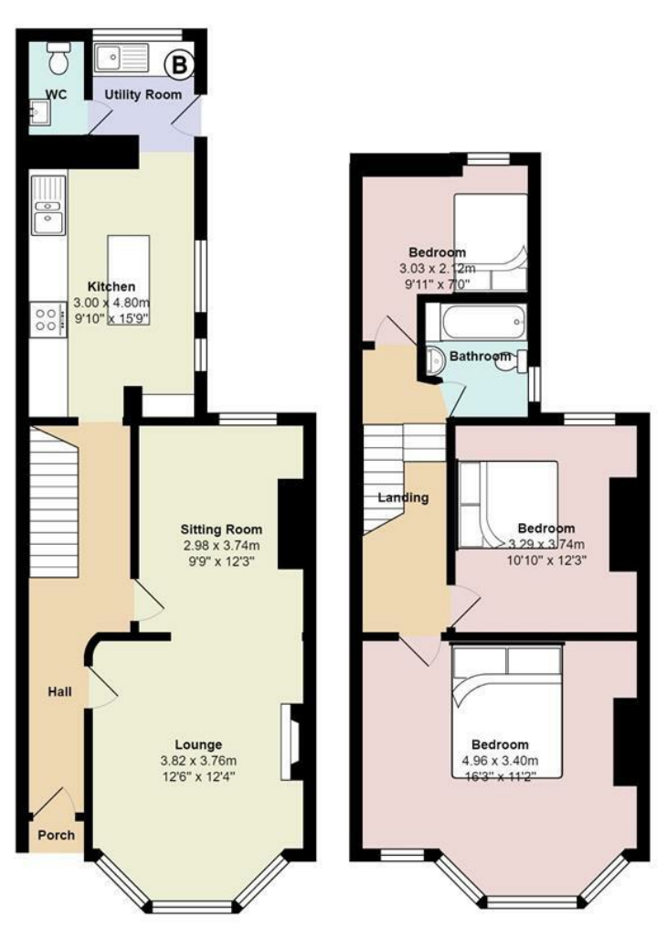
Total Area: 115.4 m<sup>2</sup> ... 1242 ft<sup>2</sup> All measurements are approximate and for display purposes only

Virtual Reality & 3D Scaled models of all of our properties for sale. You can even walk around them on our website