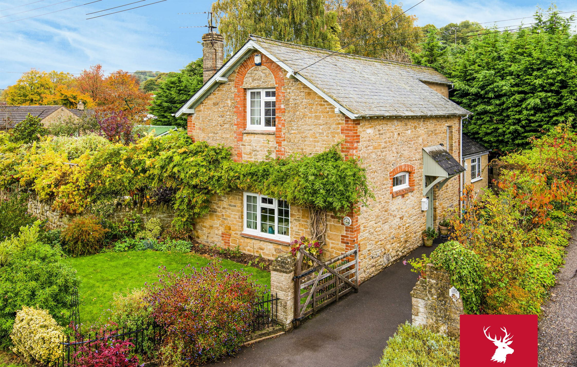
Cider Press Barn