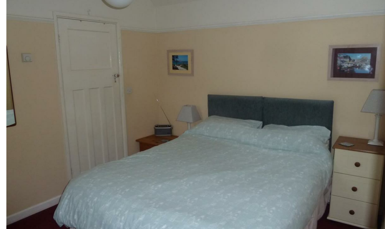
VICARAGE ROAD, TYWARDREATH £550 PCM