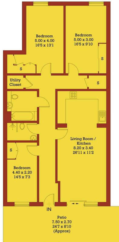
Illustration for identification purposes only, measurements are approximate, not to scale. FloorplansUsketch.com © 2020 (ID701621)