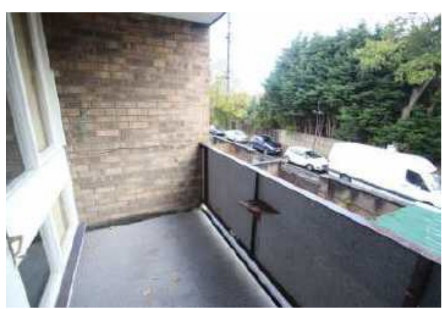
GUIDE PRICE £110,000