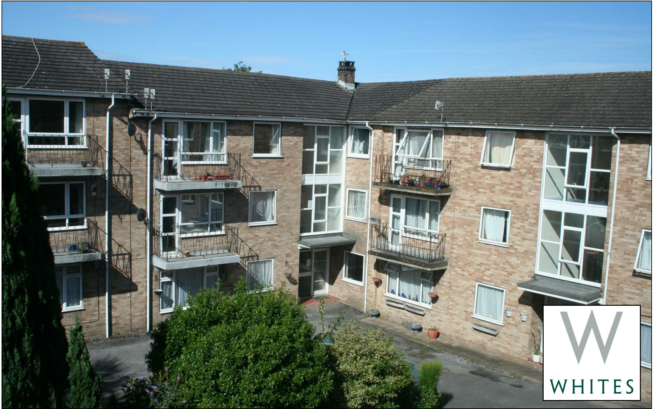
Flat 20 Cleveland Flats, Fairview Road, Salisbury, Wilts, SP1 1JY