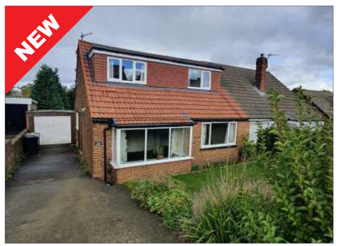
20 Springbank Ave, Farsley, LS28 5LW

36 Town Street, Farsley, Leeds, West Yorkshire, LS28 5LD Telephone: 0113 2040 322 Fax: 0113 2560 899 Email: info@julieshomes.co.uk www.julieshomes.co.uk