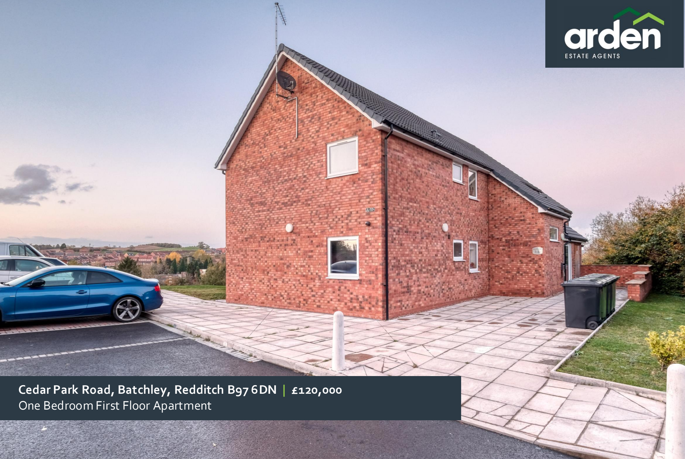
Cedar Park Road, Batchley, Redditch B97 6DN | £120,000 One Bedroom First Floor Apartment