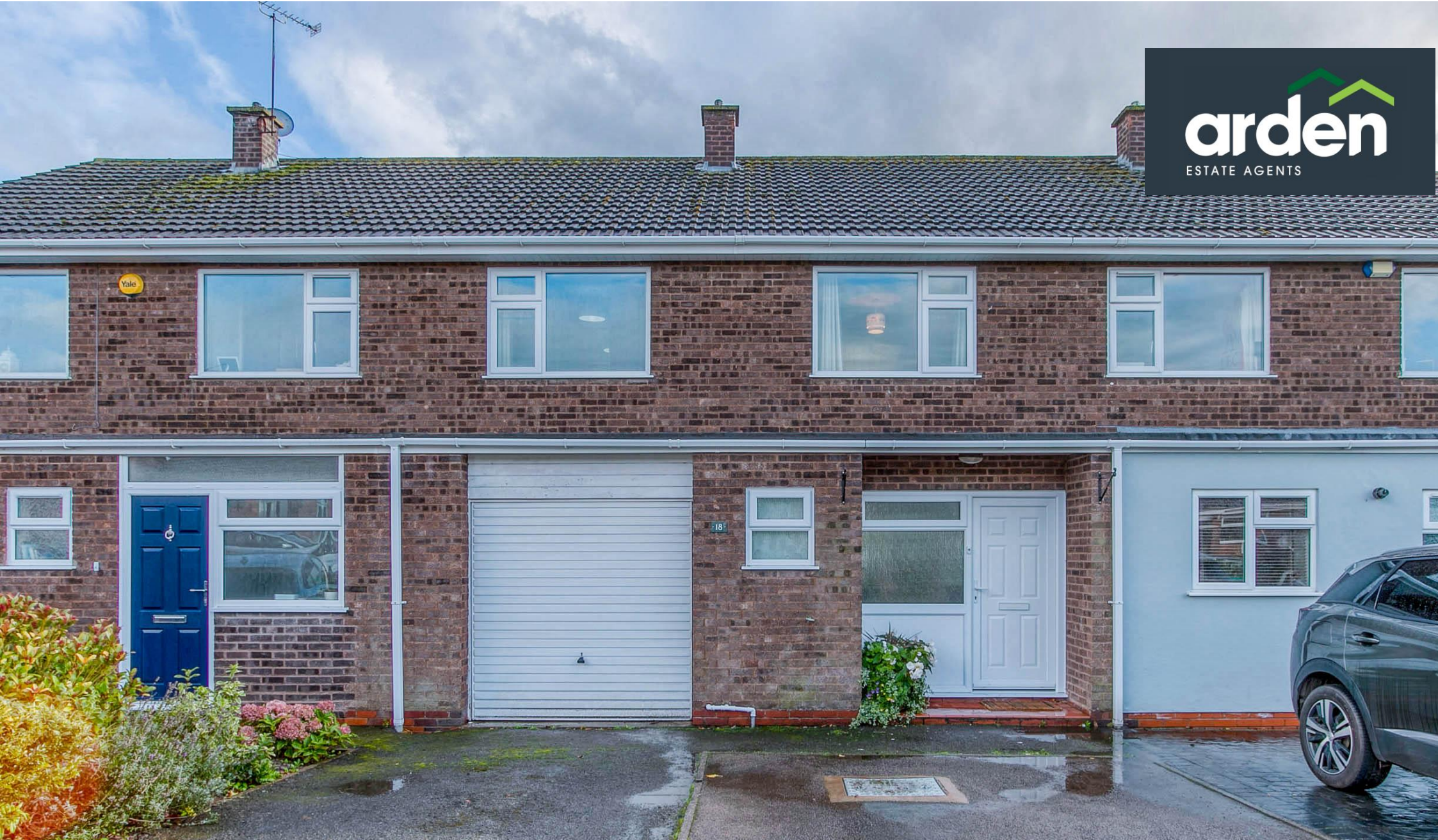
Churchway Piece, Inkberrow, Worcester WR7 4HB | £260,000 Three Bedroom Mid Terraced House