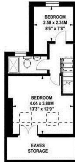
Second Floor 425 sq ft

The floor plan is not to scale and measurements and areas shown are approximate and therefore should be used for illustrative purposes only. The plan has been prepared in accordance with the RICS code of Measuring Practice and whilst we have confidence in the information produced, it must not be relied on. If there is any aspect of particular importance, you should carry out or commission your own inspection of the property. Copyright of FeaturePRO.