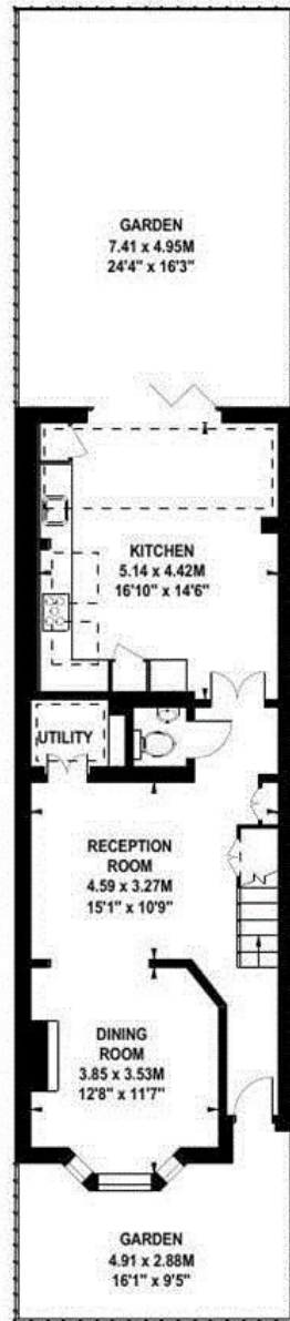
Ground Floor 668 sq ft