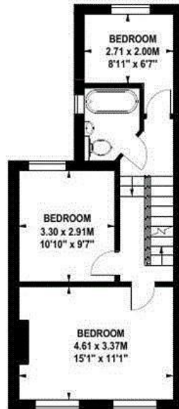
First Floor 469 sq ft