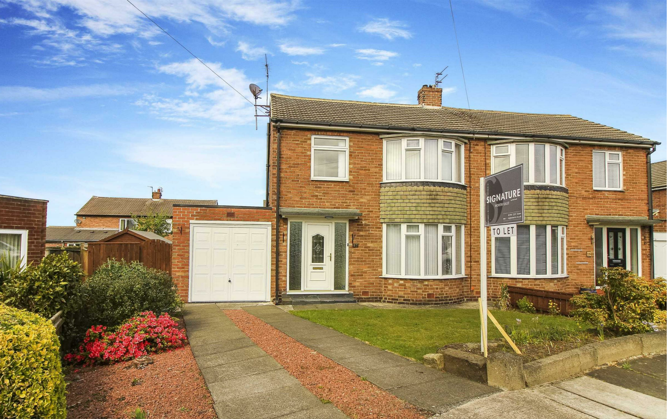
📍 Corbridge Avenue, Wideopen NE13 6JS