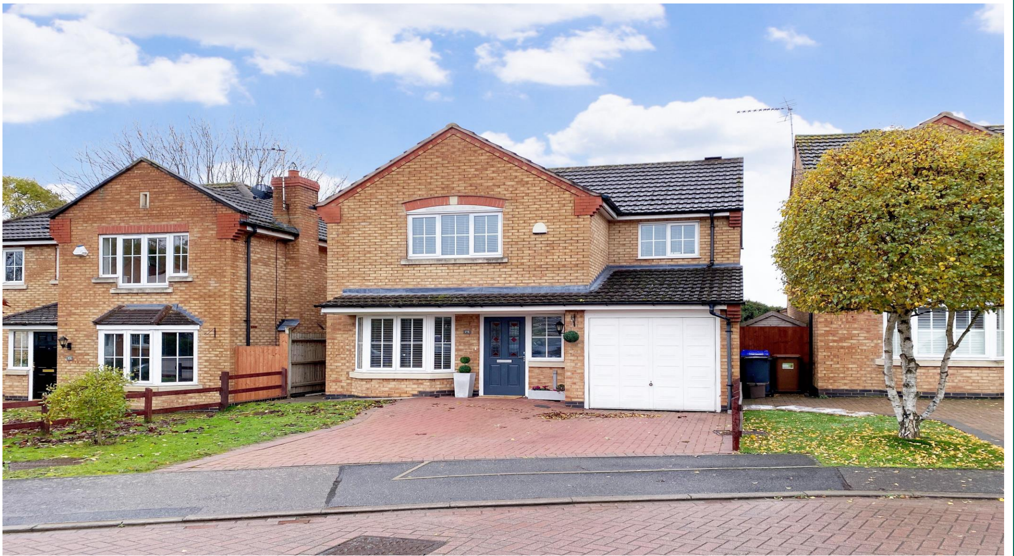
Battalion Drive Wootton, Northampton