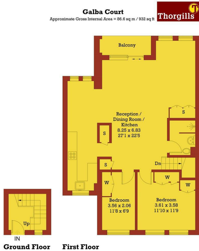
Illustration for identification purposes only, measurements are approximate, not to scale. FloorplansUsketch.com © 2020 (ID675787)

These particulars, whilst believed to be accurate are set out as a general outline only for guidance and do not constitute any part of an offer or contract. Intending purchasers should not rely on them as statements of representation of fact, but must satisfy themselves by inspection or otherwise as to their accuracy. No person in this firm's employment has the authority to make or give any representation or warranty in respect of the property.