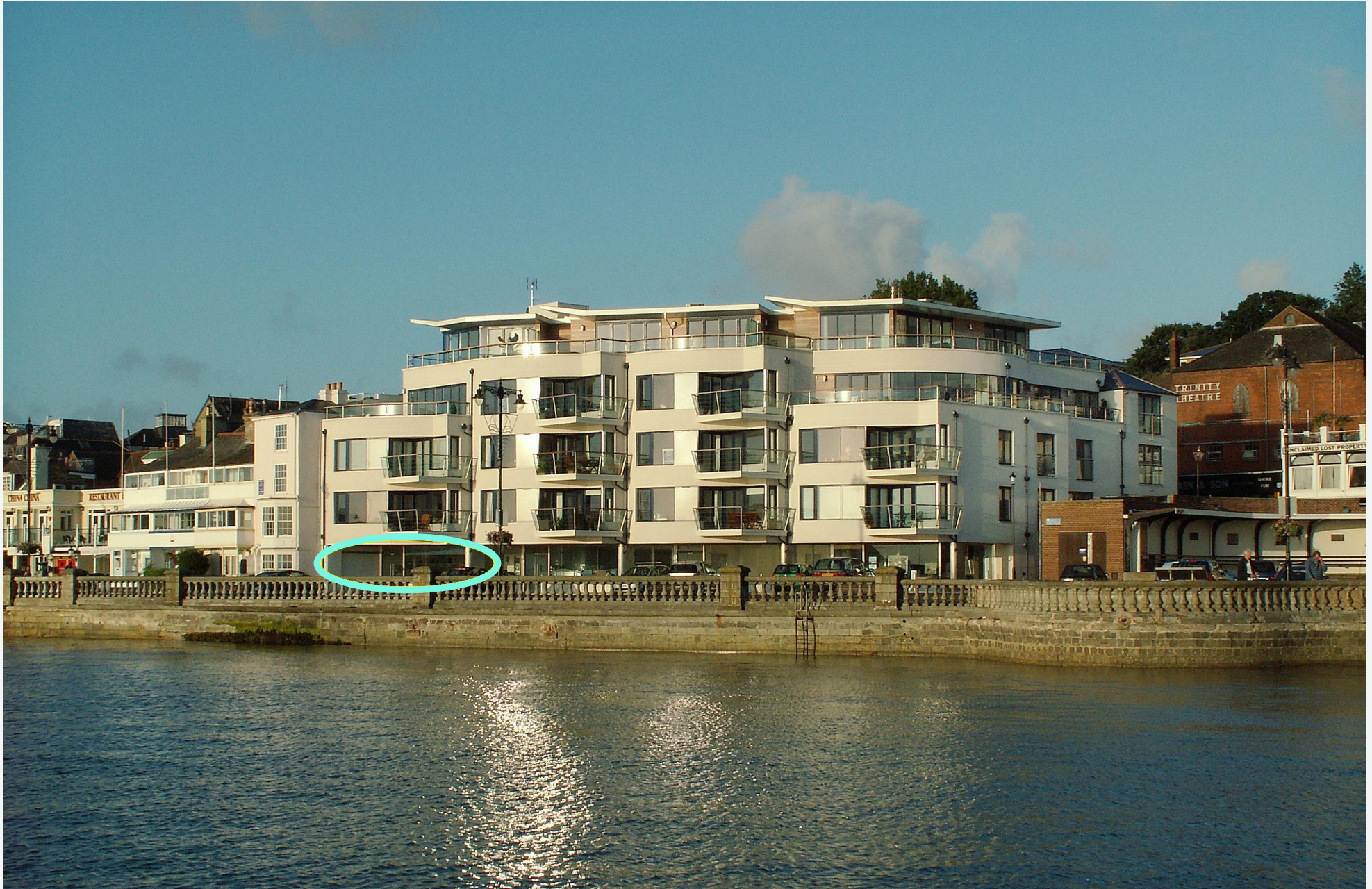
Unit 5, Pimento House, Number One The Parade, Cowes, Isle Of Wight, PO31 7QJ