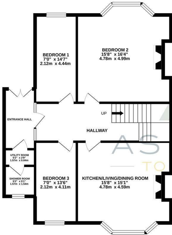
GROUND FLOOR 874 sq.ft. (81.2 sq.m.) approx.