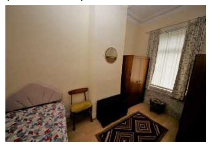
LIVING ROOM 3.71 X 4.55 (12'2" X 14'11")