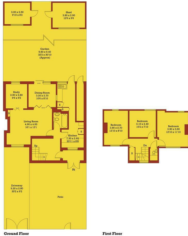
Illustration for identification purposes only, measurements are approximate, not to scale. FloorplansUsketch.com © 2020 (ID703648)

These particulars, whilst believed to be accurate are set out as a general outline only for guidance and do not constitute any part of an offer or contract. Intending purchasers should not rely on them as statements of representation of fact, but must satisfy themselves by inspection or otherwise as to their accuracy. No person in this firm's employment has the authority to make or give any representation or warranty in respect of the property.