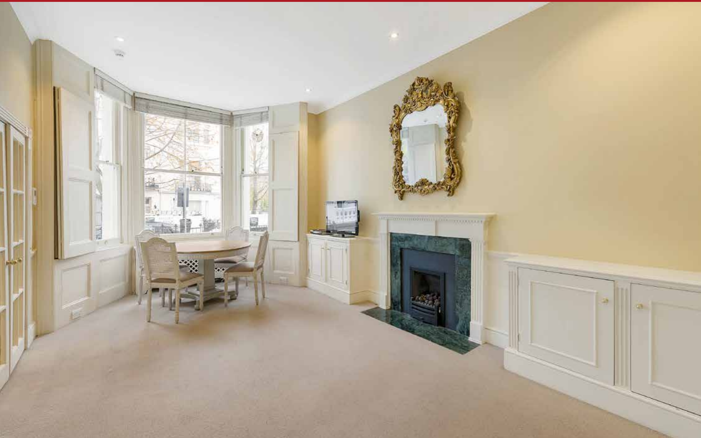
BERKELEY GARDENS KENSINGTON W8