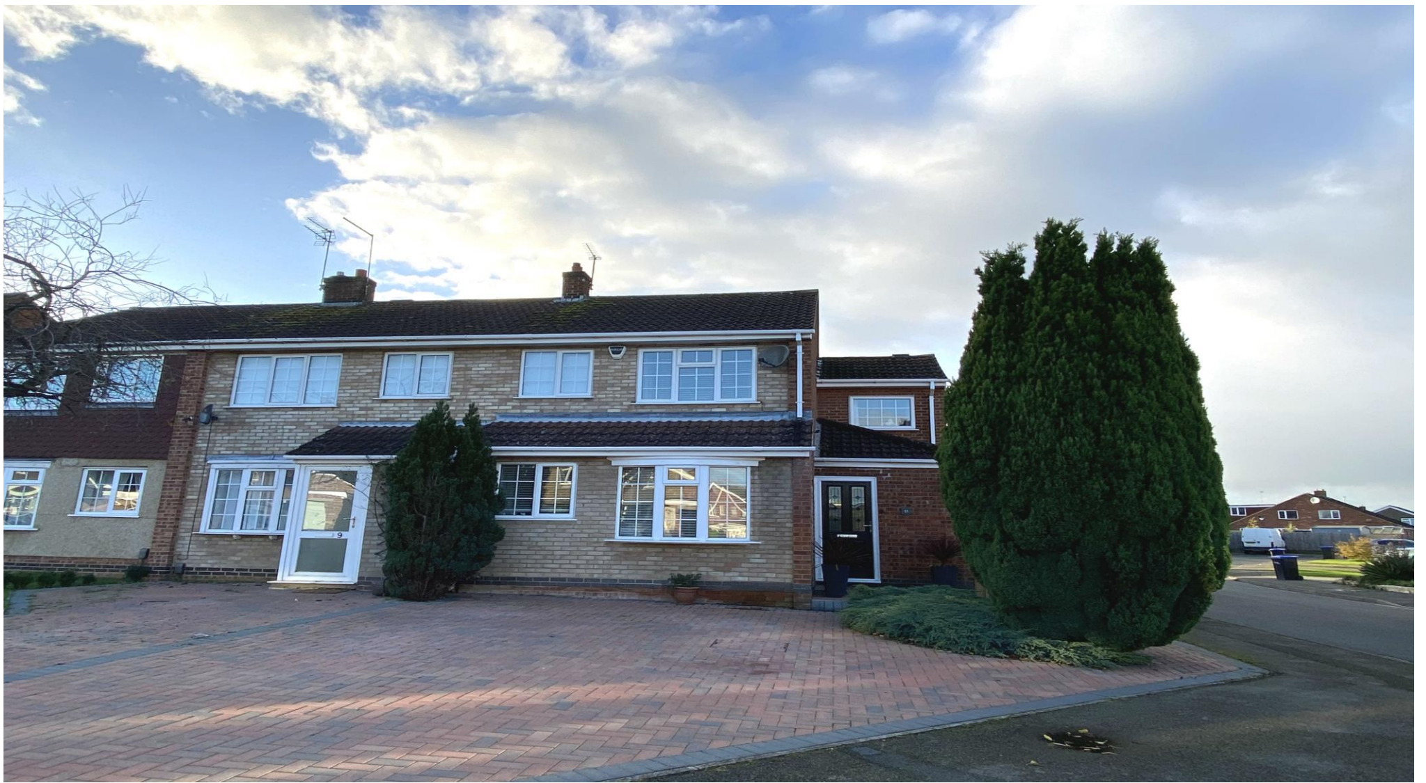
Rutland Walk Moulton, Northampton