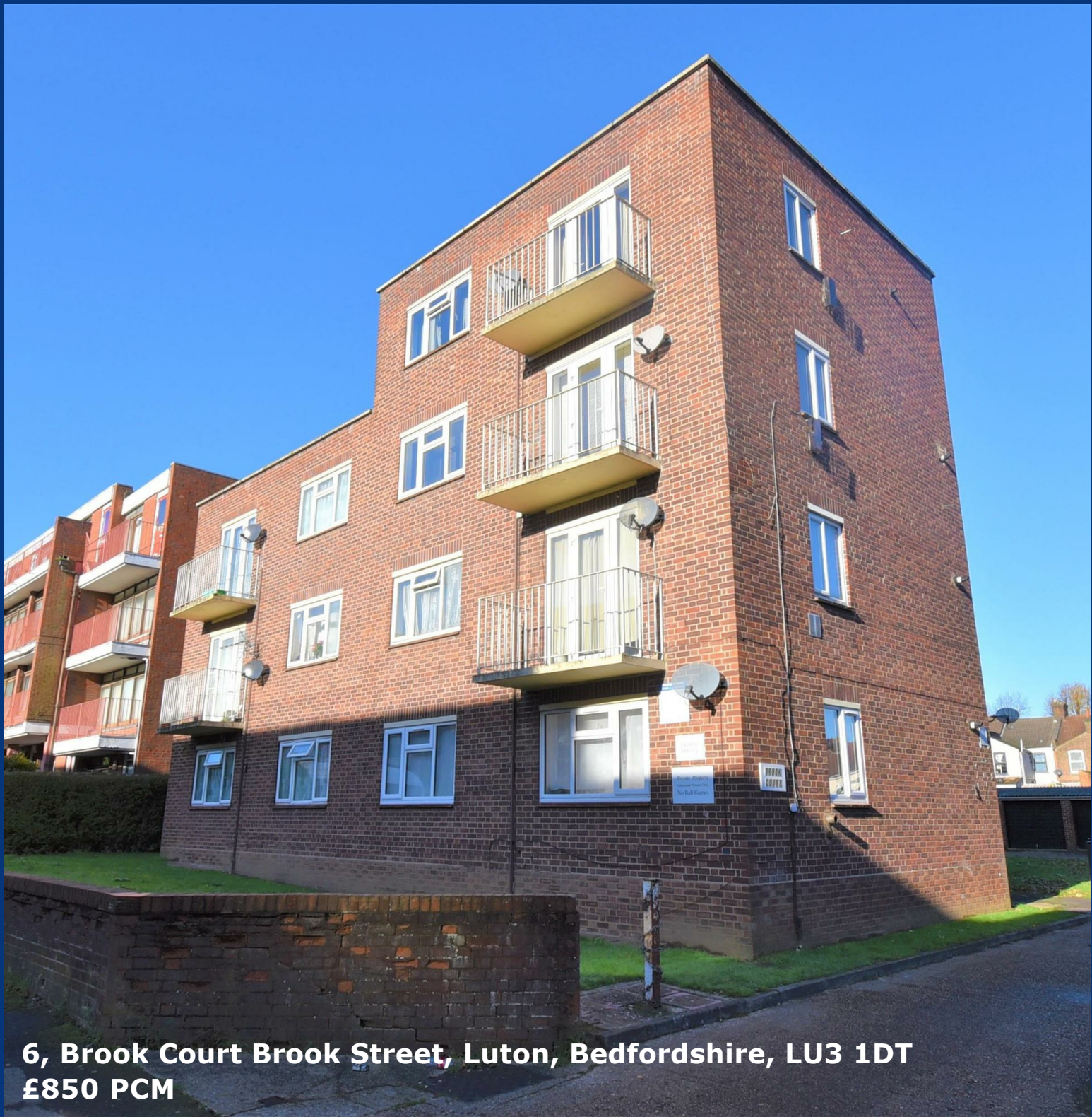
6, Brook Court Brook Street, Luton, Bedfordshire, LU3 1DT £850 PCM