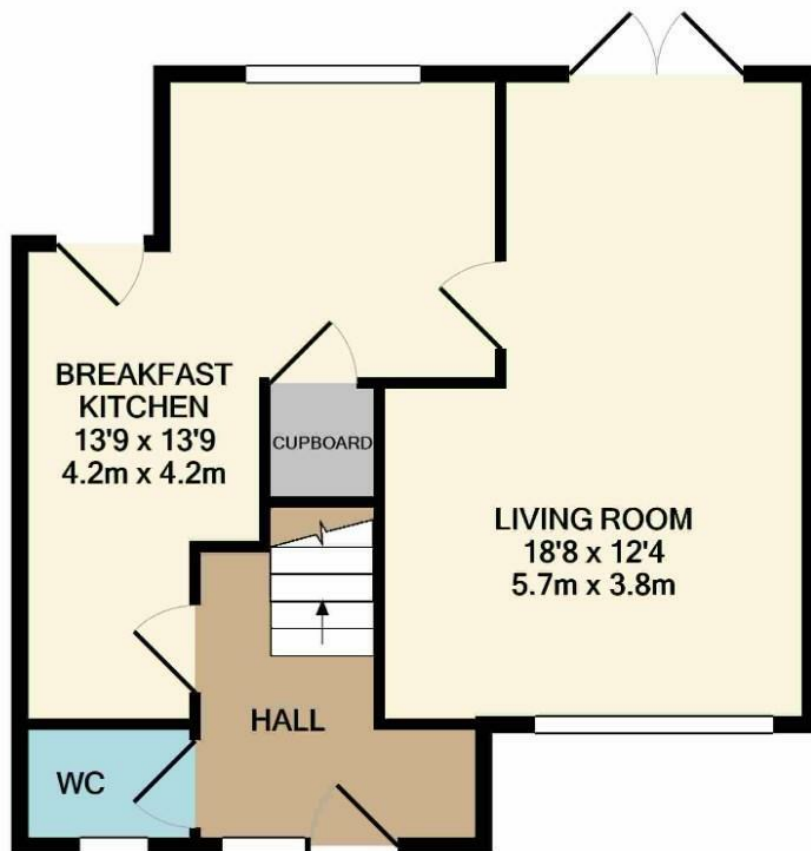
GROUND FLOOR APPROX. FLOOR AREA 448 SQ.FT. (41.6 SQ.M.)