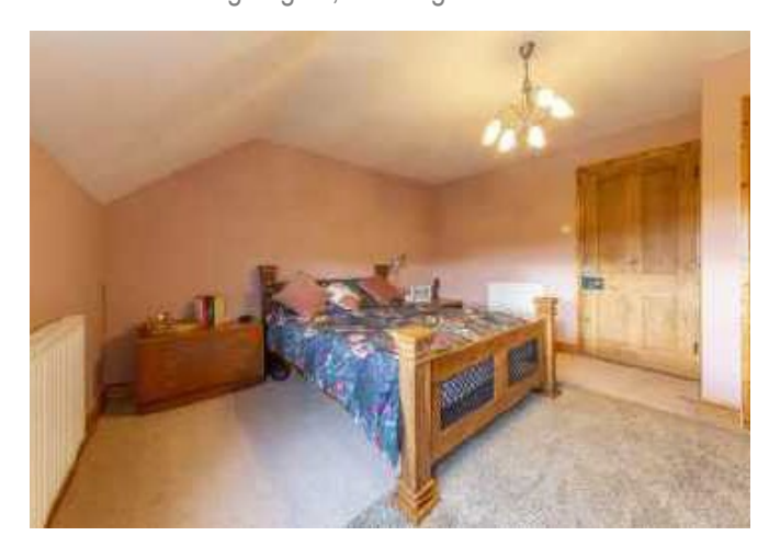
Bedroom 2 With two fitted cupboards having hanging rail and shelves and upvc double glazed window overlooking the rear garden.

Bedroom 1 Having fitted wardrobe with hanging rail and shelf, wall mounted radiator and upvc double glazed window to frontage again, showing off the fantastic views