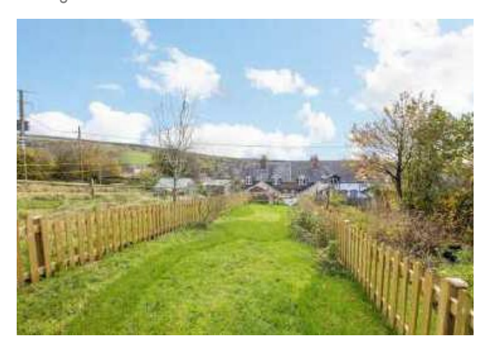
Tenure We understand the property to be freehold

Agents Note As is common with older terraced properties there is a right of access across the rear of the terrace.