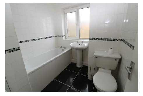
9 Botham House St Johns Green, North Shields, NE29 6PG

This Two Bedroom Masionette situated within Botham House, St Johns Green, briefly comprising Lounge/dining room, Kitchen, Two double bedrooms, bathroom/w.c. Please call Trading Places for further information 0191 251 1189 EPC to follow.