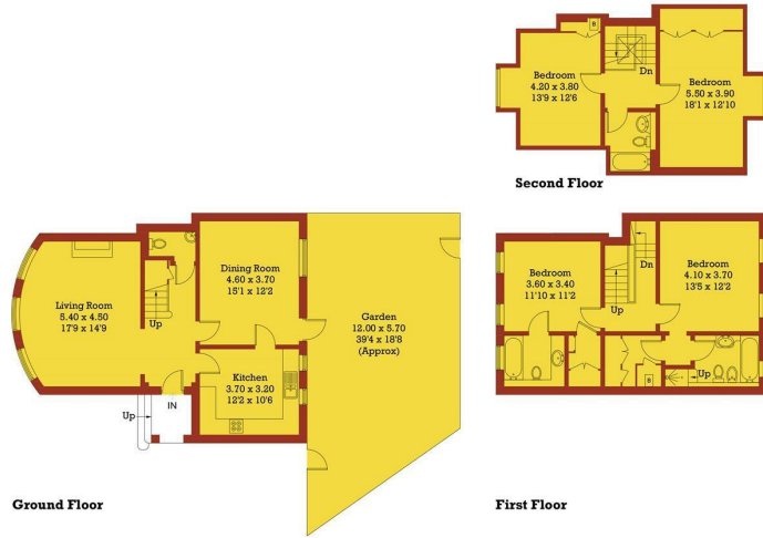
Illustration for identification purposes only, measurements are approximate, not to scale. FloorplansUsketch.com © 2020 (ID705416)