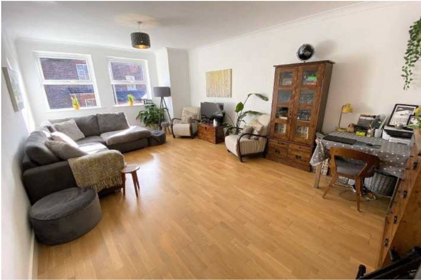
Victoria Court, Didsbury M20 1FR Guide price £262,500