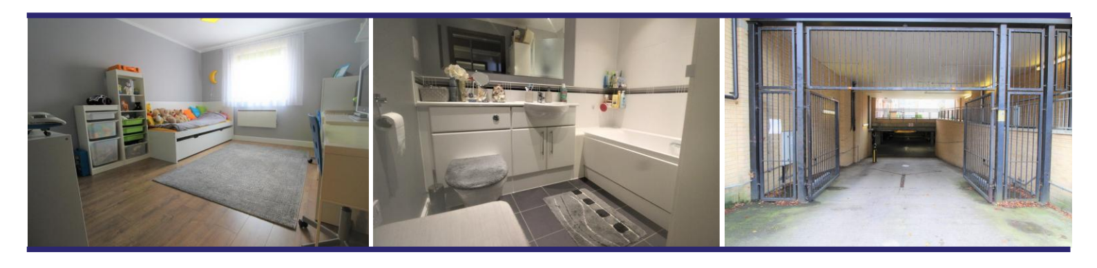
511 sq.ft. (47.5 sq.m.) approx.