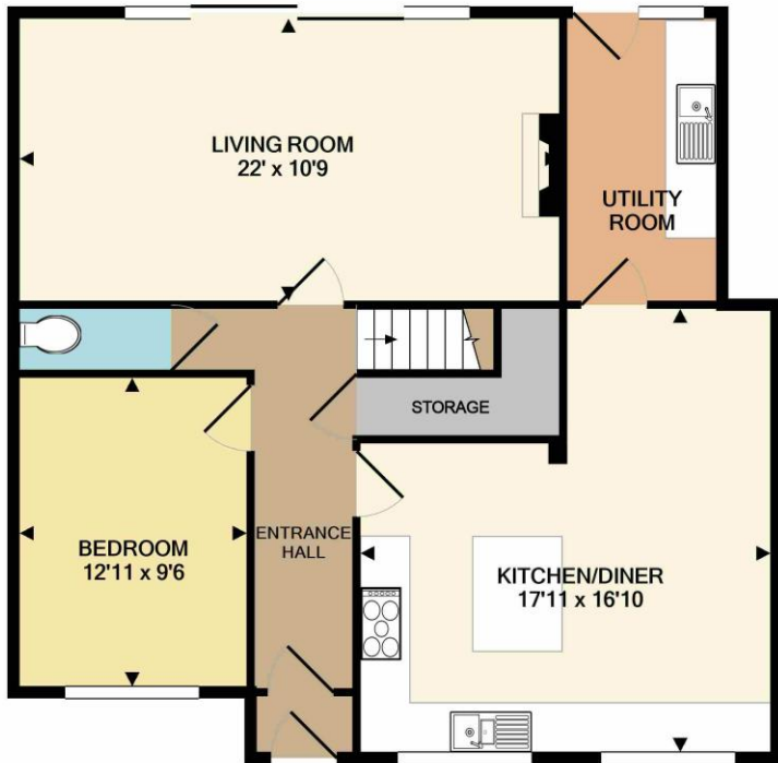
GROUND FLOOR APPROX. FLOOR AREA 859 SQ.FT.