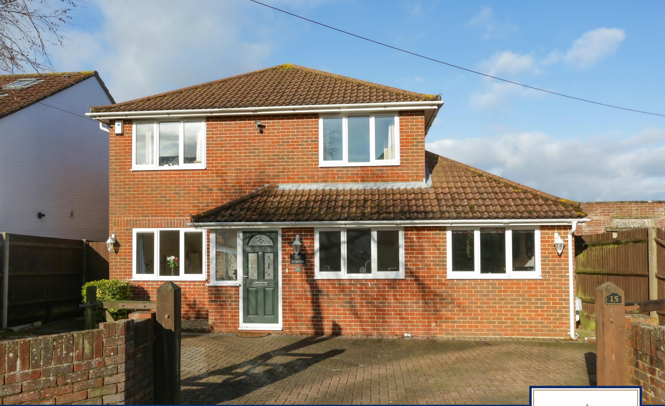
The Droveaway, St. Margarets Bay