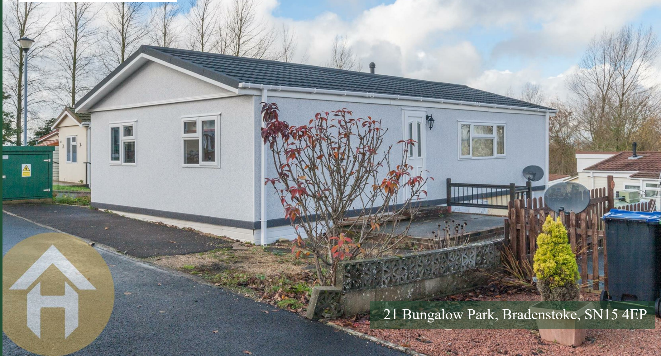
21 Bungalow Park, Bradenstoke, SN15 4EP