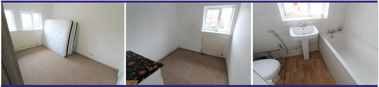
GROUND FLOOR 389 sq.ft. (36.2 sq.m.) approx.