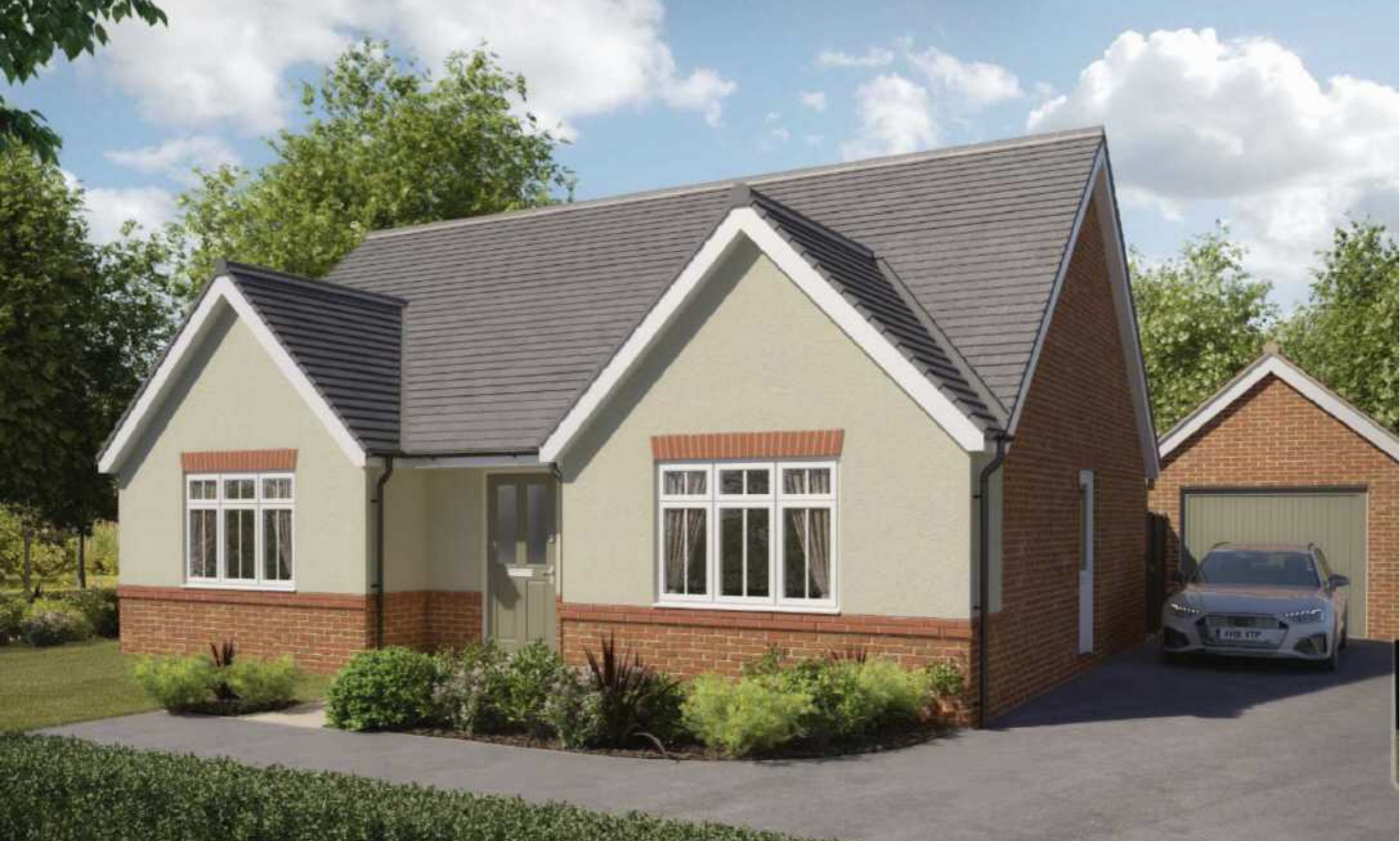
Berkeley, Plot 15 Whistledown View Upavon, SN9 6EF