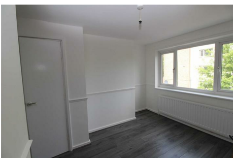
6 Fletcher House St Johns Green, North Shields, NE29 6PN

Trading Places are please to welcome to the market this two bedroom first floor flat in Fletcher House for immediate rent. The property has been fully refurbished throughout to a high standard. Ready to move into immediately. The property is conveniently location with access to local Metro Station, bus routes and Royal Quays shopping outlet. Situated close to the A19 and Tyne Tunnel for South of the Tyne and access into Newcastle. Briefly comprising:- Communal entrance, stairs to upper floors, entrance hallway, lounge with fireplace and patio doors to Juliette balcony, fitted kitchen with built in appliances, stairs to first floor, two bedrooms and a bathroom wc. EPC Rating E.Please call 0191 251 1189 to arrange to view the property,