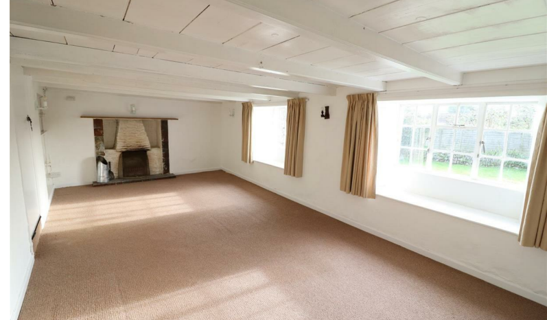
BOLINGEY, PERRANPORTH £1,000 PCM