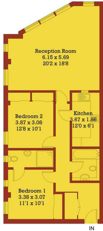
Illustration for identification purposes only, measurements are approximate, not to scale. FloorplansUsketch.com © 2020 (ID707391)