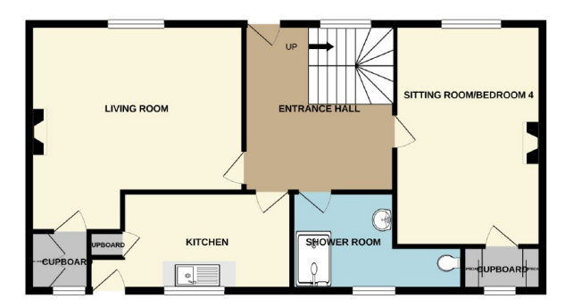
GROUND FLOOR 807 sq.ft. (74.9 sq.m.) approx.