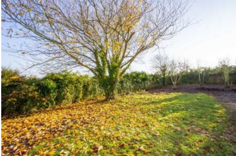
Law Cottage, Coldingham, Berwickshire, TD14 5PY