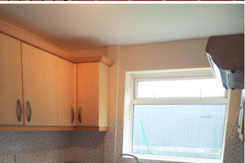
Riddings Road | Sunderland | SR5 5LP