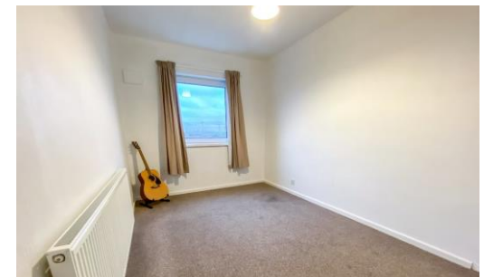
Bedroom Three (rear)