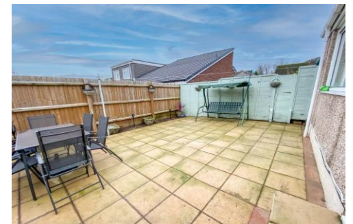
Rear Patio Garden