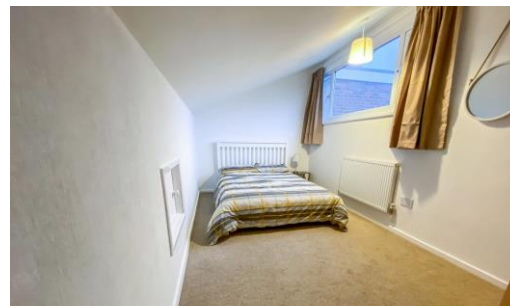
Bedroom Two (front)