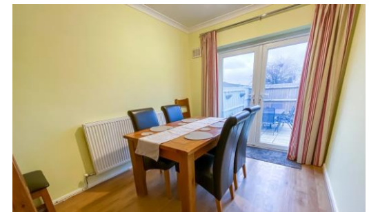
Dining Room / Bedroom