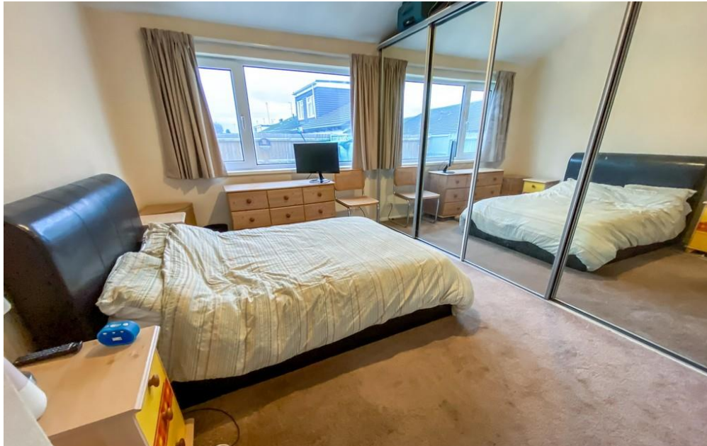
Ground Floor Bedroom One