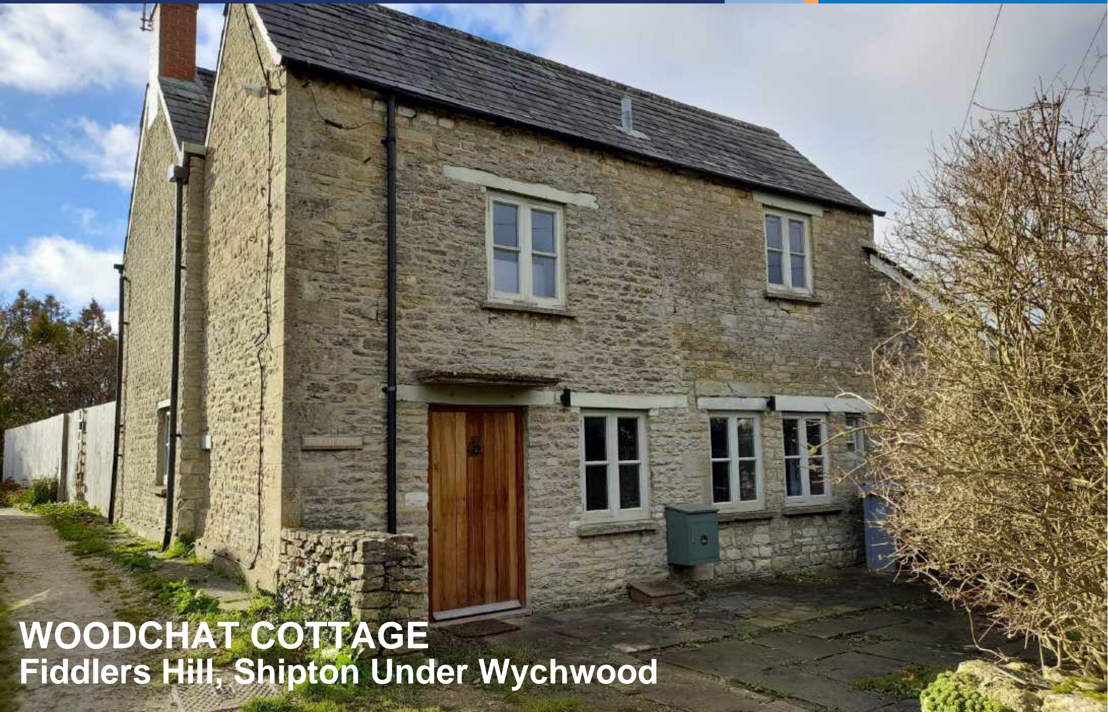
WOODCHAT COTTAGE Fiddlers Hill, Shipton Under Wychwood