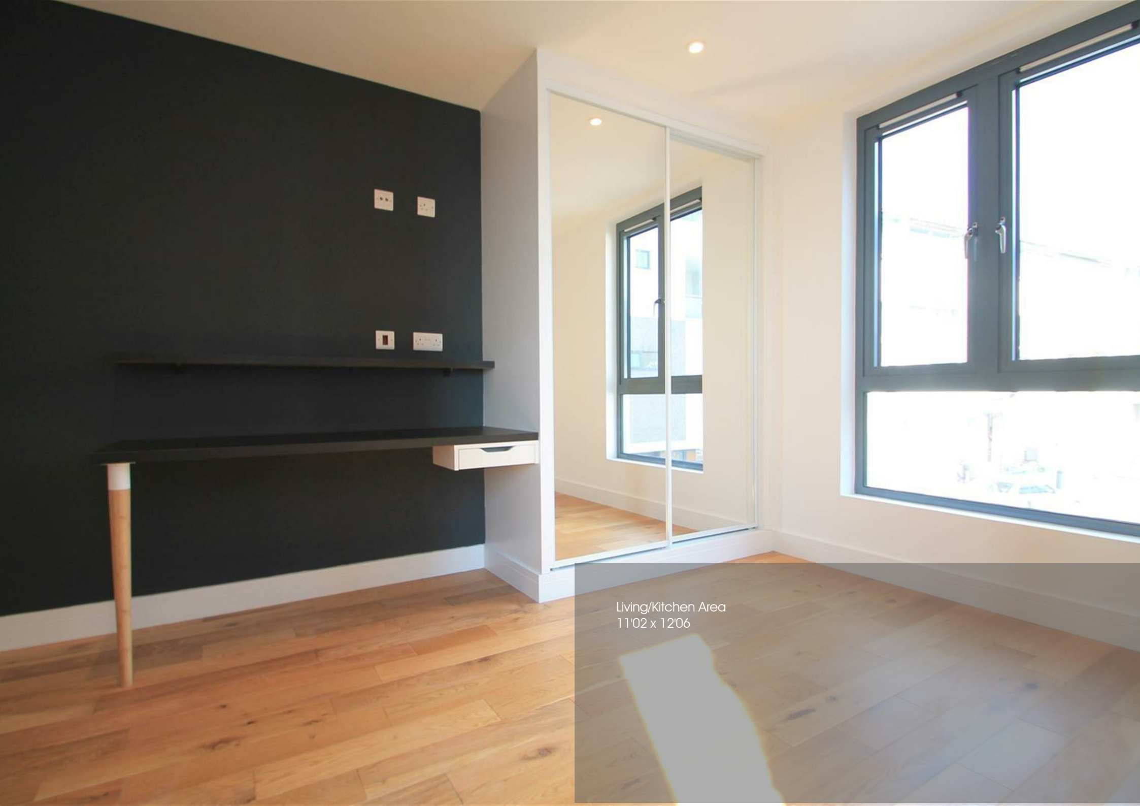
Living/Kitchen Area 11'02 x 12'06