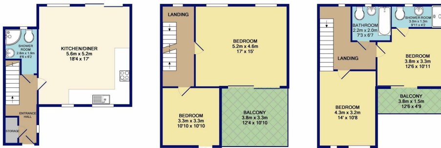
GROUND FLOOR APPROX. FLOOR AREA 41.1 SQ.M. (442 SQ.FT.)