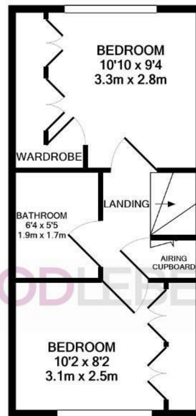
1ST FLOOR APPROX. FLOOR AREA 320 SQ.FT. (29.7 SQ.M.)

TOTAL APPROX. FLOOR AREA 640 SQ.FT. (59.4 SQ.M.)